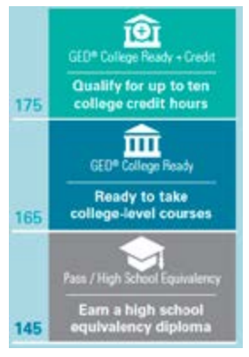
GED* College Ready or GED* College Ready + Credit scores

The High School Equivalency (HSE) team is always in a high state of excitement in May as we move closer to our bi-annual graduation. Our graduates will round out at about 20, and we have several students who have studied for two years with us (second language learners) who have finally achieved the GED diploma! Many of our students work outside the home and are also parents, so this accomplishment is that much more outstanding, and we are so thankful for our many experienced teachers and tutors who work every day, week in and week out, for months, supporting students, practicing reading and writing skills, reinforcing social studies and science content, and bringing high-level math to light for students, sometimes sparking a newfound sense of potential and real confidence in our adult learners that they can succeed beyond the GED.