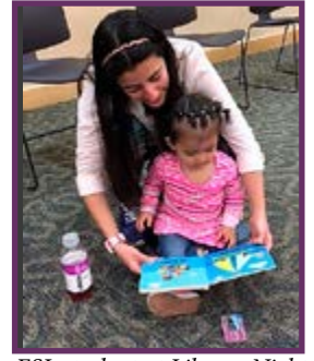
ESL student at Library Night

The next few months will be very busy for the ESL team as they plan for their fall expansion of classes in Cortez. Due to the recent award of the competitive grant from the Colorado Department of Education, the much-needed English classes will resume and will serve those students who were previously on the long waiting list.