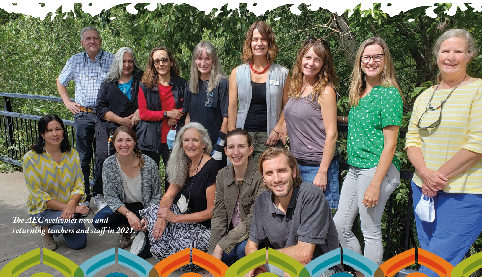
The AEC welcomes new and returning teachers and staff in 2021.