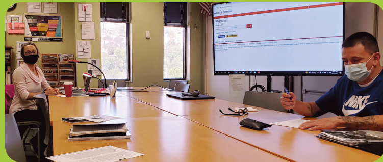
Cyd Franken's HSE students can attend in person or online.