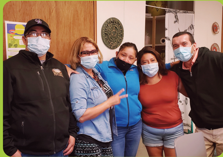
These ESL students love returning to classroom learning.